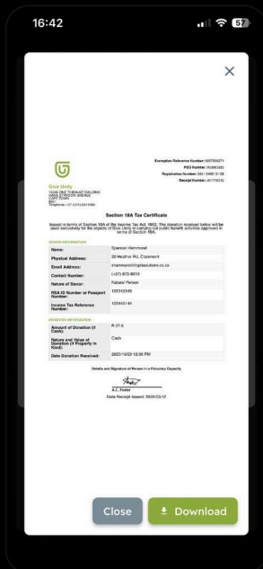
AUTOMATED TAX LOGIC

Native biometric payment integration ensures a "Zero-Friction" path to conversion.